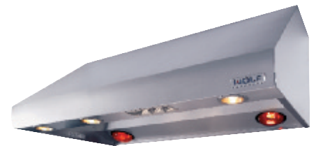
Model PW602718 Pro Wall Hood

Accessories are available through your authorized Wolf dealer. For local dealer information, visit the find a showroom section of our website, wolfappliance.com .