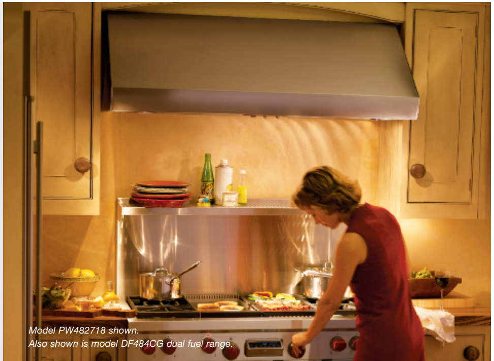
Model PW482718 shown. Also shown is model DF484CG dual fuel range.

Along with standard features like heat sentry and dual setting halogen lighting, the pro 27" deep wall hoods provide an additional exclusive feature — heat lamps. Pro 27" deep wall hoods are available in seven widths.