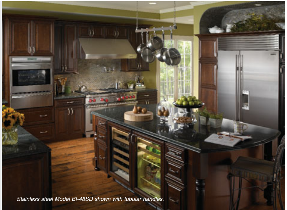
Stainless steel Model BI-48SD shown with tubular handles.

Side-by-side Model BI-48SD offers maximum refrigeration capacity along with an ice and water dispenser through the refrigerator door. Sub-Zero dual refrigeration along with new air purification and water filtration systems guard the freshness of your food and water like nothing before. Framed, overlay/flush inset and stainless steel models are available. New flush inset installation allows the unit to sit flush with surrounding cabinetry.