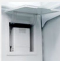
Air Purification System