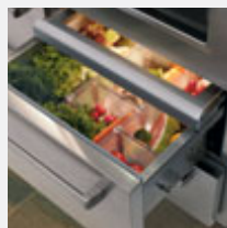
Glass Crisper Lid