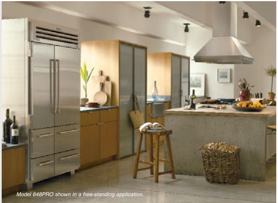
Model 648PRO shown in a free-standing application.

Born of 100% steel (and a good bit of bravado), the Model 648PRO is a true masterpiece of preservation. Its sculpted metal, dual refrigeration with three evaporators and advanced controls marry performance and design in a bold new way for home refrigeration. So it not only keeps foods magnificently fresh, it brings the whole kitchen tastefully up to date. Model 648PRO can be built-in or used in a free-standing application.